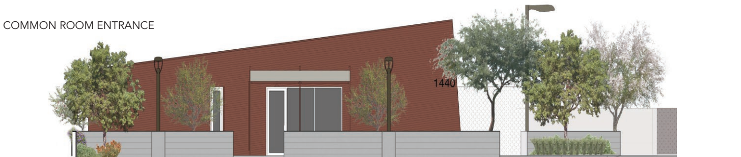
COMMON ROOM ENTRANCE

Micro Estates are offered by Newtown CDC, a Tempe-based 501(c)(3) nonprofit organization. Our mission is to increase the supply of permanently affordable housing while developing and supporting homebuyers through innovative programs and partnerships. Visit our website to learn how our HUD-approved housing counseling agency can help you get ready to be a homeowner.